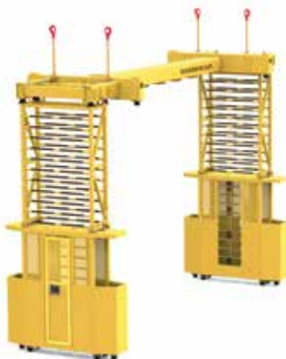
Telescopic or Fixed Gondola Cage